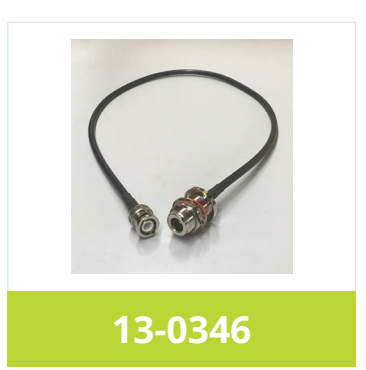
Cable Assembly (18 In, RG-58, N female bulkhead ↔ BNC male) *Used to connect RG-8 with N male to enclosure body

Cable Assembly (25 Ft, RG-58, BNC male ↔ N male)