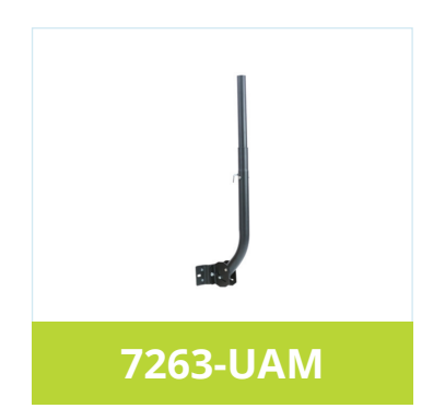
Universal Antenna Mount