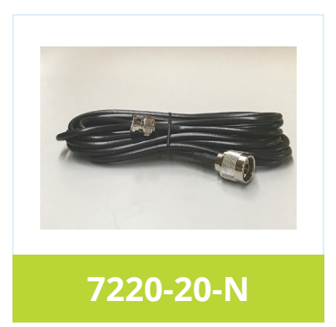
Cable Assembly (20 Ft, RG-58, BNC male ↔ N male)