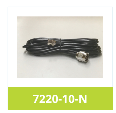
Cable Assembly (10 Ft, RG-58, BNC male ↔ N male)