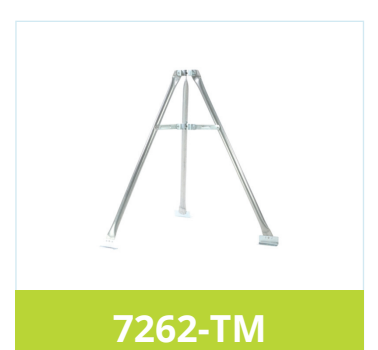
Tripod Mount 3'